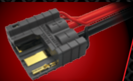
Integrated LiPo Balance Charging Wires