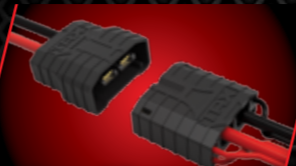
High-Current Connector with Gold-Plated Copper Terminals

Use with Traxxas iD Chargers for the easiest and safest charging solution Traxxas® iD™ chargers auto-detect iD equipped Traxxas batteries and automatically optimize charge settings for worry-free charging*