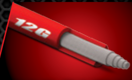
MAXX® Cable High-Efficiency 12-Gauge Silicone Jacketed Wire